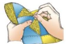
Stitch and Chat