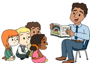
Guest Readers Needed