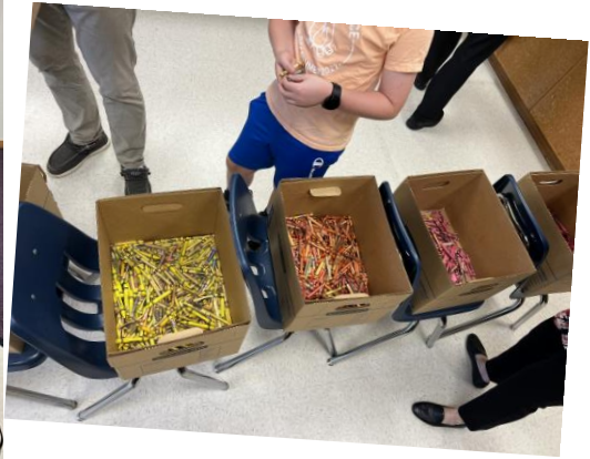
Volunteers sorted hundreds of crayons by color to be sent to the Crayon Initiative