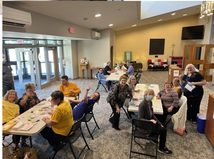
Having fun making cards to spread sunshine and hope to those in need.