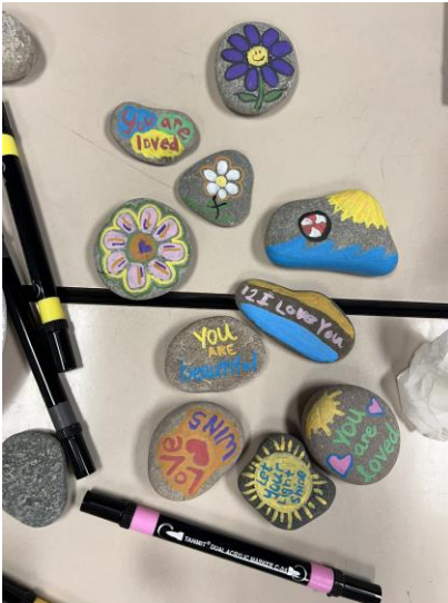
Kindness rocks were painted and will be spread throughout our local community to be discovered by walkers.