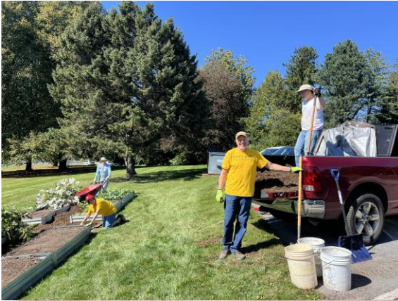
It was a beautiful day to clean up our church Food Bank garden.