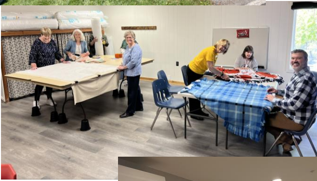
Volunteers were busy finishing up the quilts.