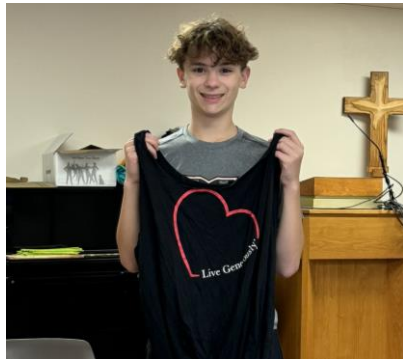
T-shirt bags and snack bags are being given to Laundry on Linden in Allentown.