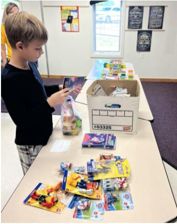
Bags were packed full of goodies for the children in LV Reilly Children's Hospital