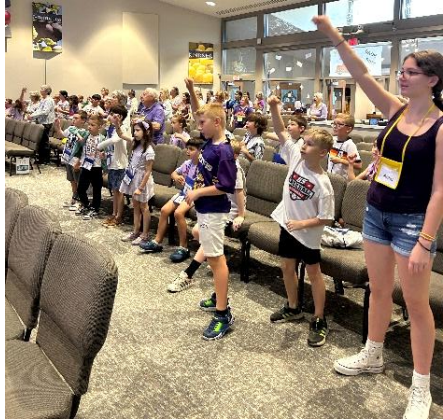
Indoor games were a hit in the rain and our openings rocked!