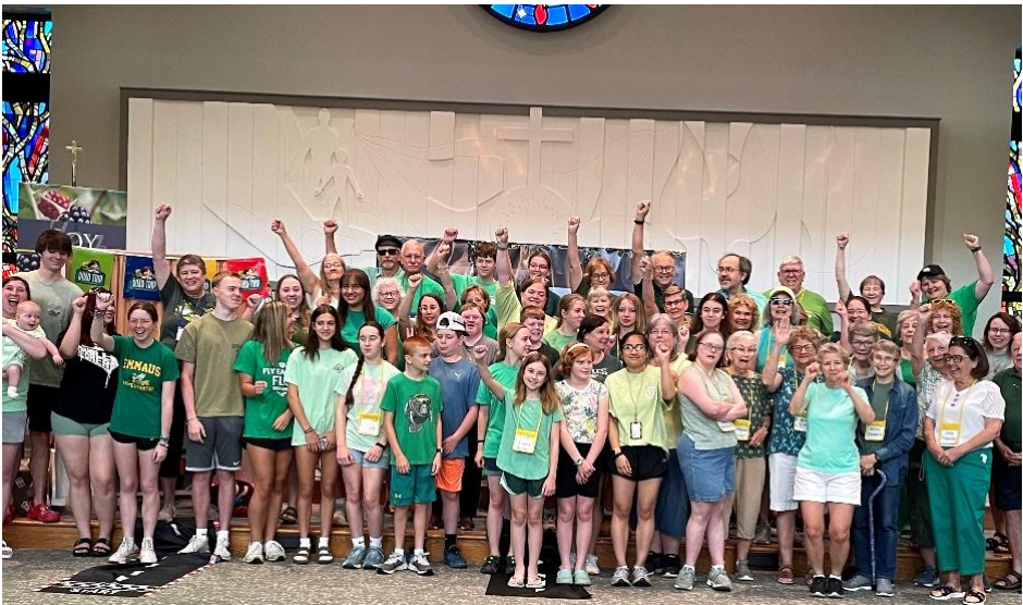
And of course, VBS wouldn't be possible without our dedicated volunteers. A huge thank you to all!