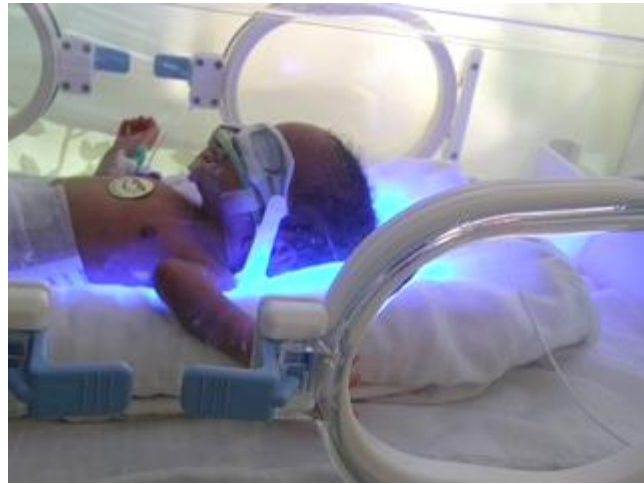
ALMC NICU – a baby under care