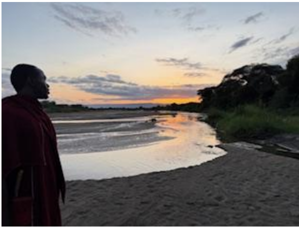
Sunset in Tarangire National Park