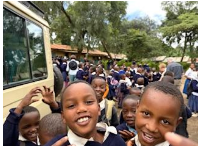
Eager Students at Olchoki Primary School