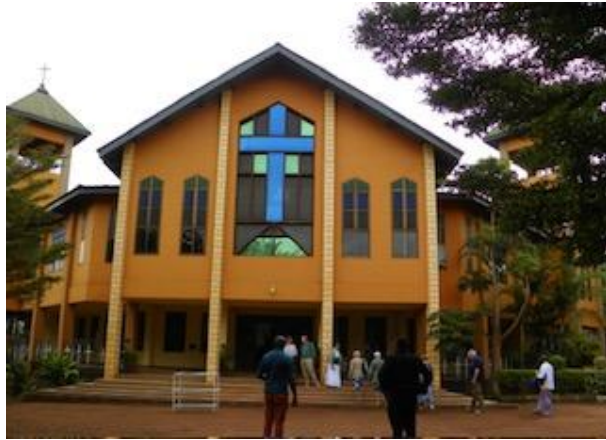
Karatu Lutheran Parish