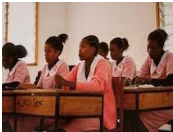
Nursing Students at ALMC school