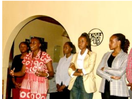
Empowered Girls, sharing personal dreams