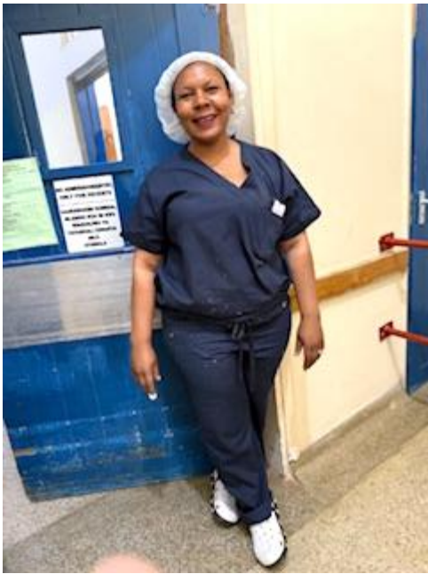
Nurse at Selian Hospital