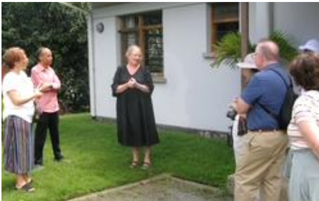
Sharing Visions about the Future Kafika House